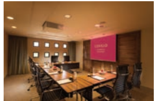
Conference Room - U-Shape Setup

Located on the fifth floor, the three boardrooms and four conference rooms are ideal for intimate meetings or breakout sessions.