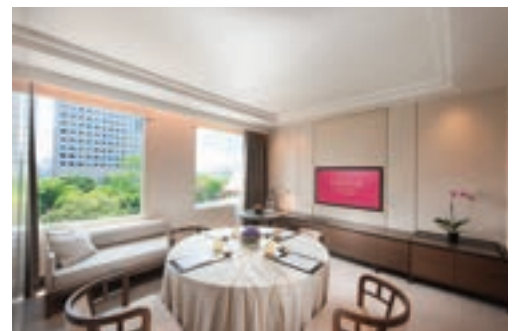
Guest rooms converted to Meeting rooms

Thirteen guest rooms on level six can be converted to breakout rooms by hiding away the beds to fit a round table for 8 people.