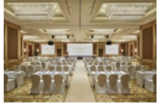
Ballroom - Classroom Setup

The Ballroom can be subdivided to accommodate smaller events.